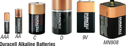
Duracell Alkaline Batteries